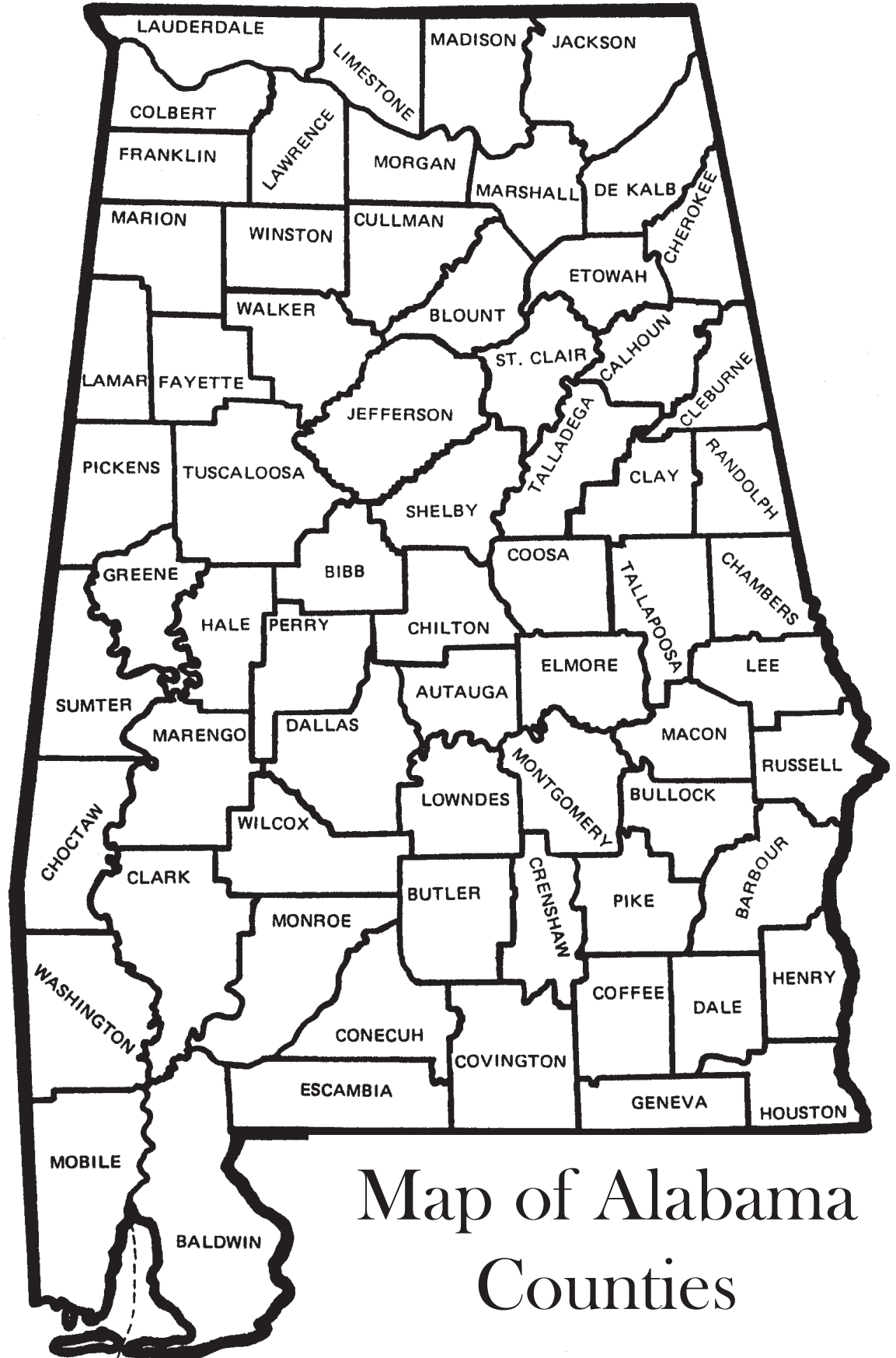
Map of Alabama Counties

Advertisements in the BULLETIN are published on a FIRST COME, FIRST SERVE basis. It is to the advertiser's advantage to submit their items as soon as possible. While the BULLETIN does not assume responsibility for transactions resulting from the use of this publication, all means of preventing fraud will be exercised. Misrepresentation will result in the revocation of all privileges. For questions concerning the guidelines, please call 334/240-7125 or e-mail afcb@agi.alabama.gov .