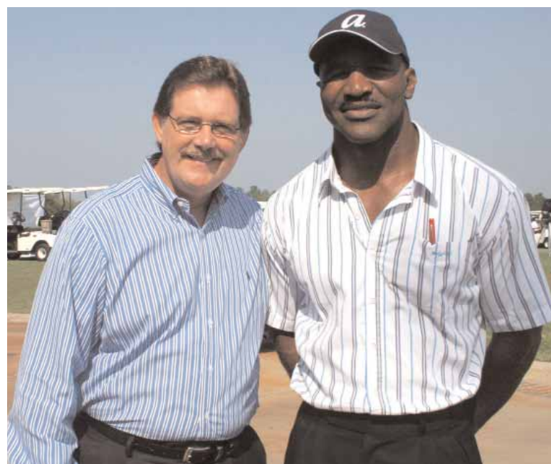
Commissioner Ron Sparks and Alabama native, Evander Holyfield, endorse the "Buy Alabama's Best" campaign.

Alabama food product sales have over a $2 billion impact on the state's economy and Alabama Food Manufacturers, Grocers and Food Service entities, including restaurants, employ approximately 250,000 people. When consumers buy from local producers, they are fueling the profits right back into the state's economy. Not only do Alabama food manu-