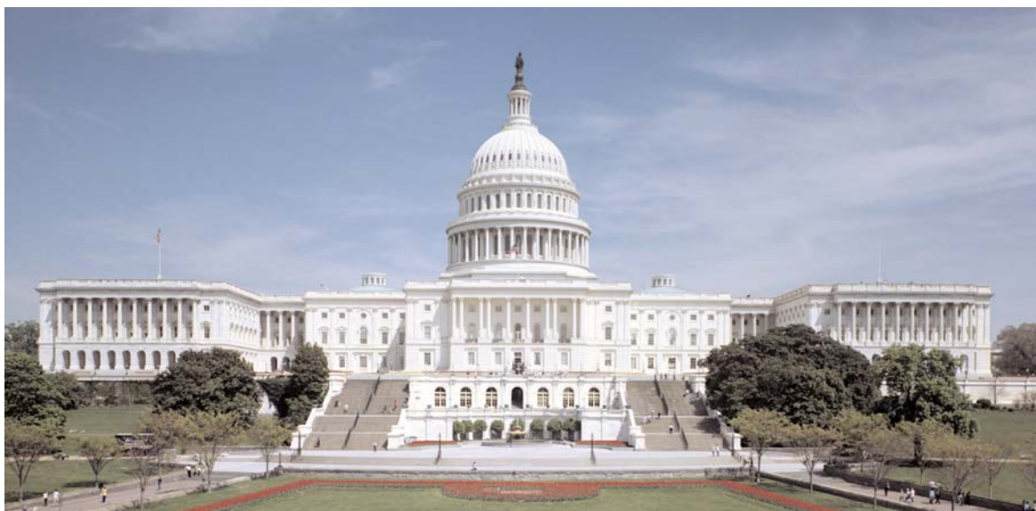
NASDA members visited Capitol Hill during the Mid-Year Conference held in February.